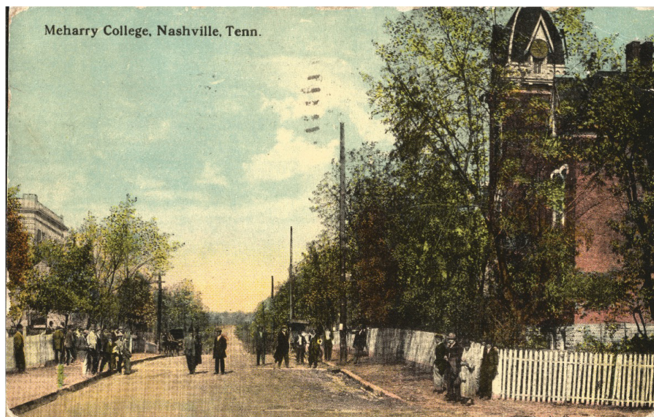
Print of Meharry College, n.d..