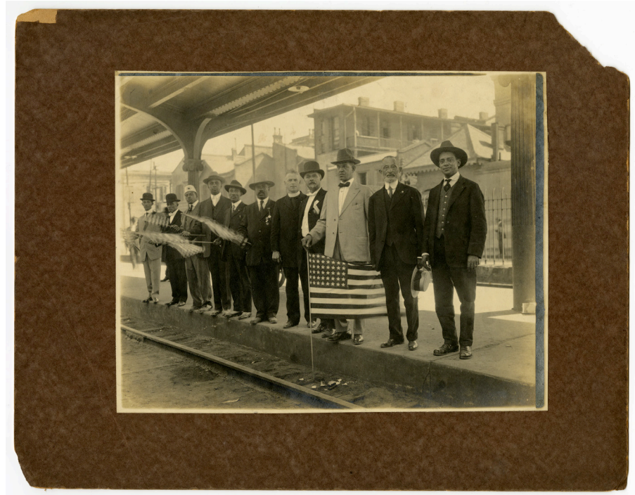
An unidentified group of men. Silver gelatin developing-out print.

mation about their relatives and that kind of thing. They're used very much.... A lot of times, we have at least 8,000 hits to the repository for (this institution). So, we were really proud of that repository in which we work with other institutions. — Master's, Large, Public