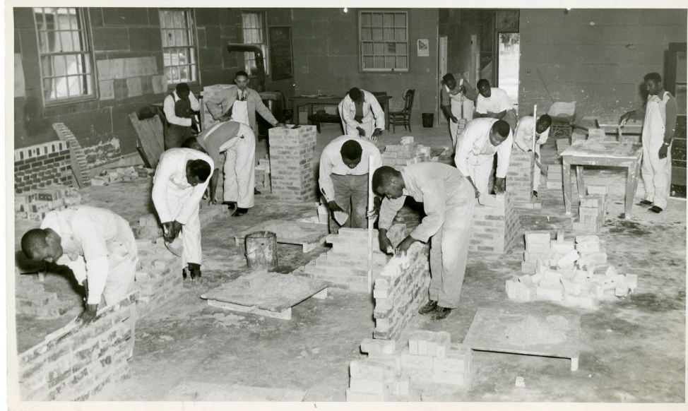
Brick mason class. Silver gelatin developing-out print.

that or whether people are really going to stay away and be prepared to work more on the online side of the library. I don't have a theory about how things are going to change that, but I think things will be different, and it's just a matter of waiting to see how different they're going to be, or, or what that new normal is going to look like. — Doctoral, Large, Public