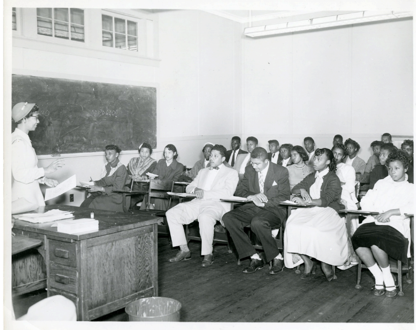
Classroom scene. Silver gelatin developing-out print.

the dean intends to expand their collection to meet the needs of students.