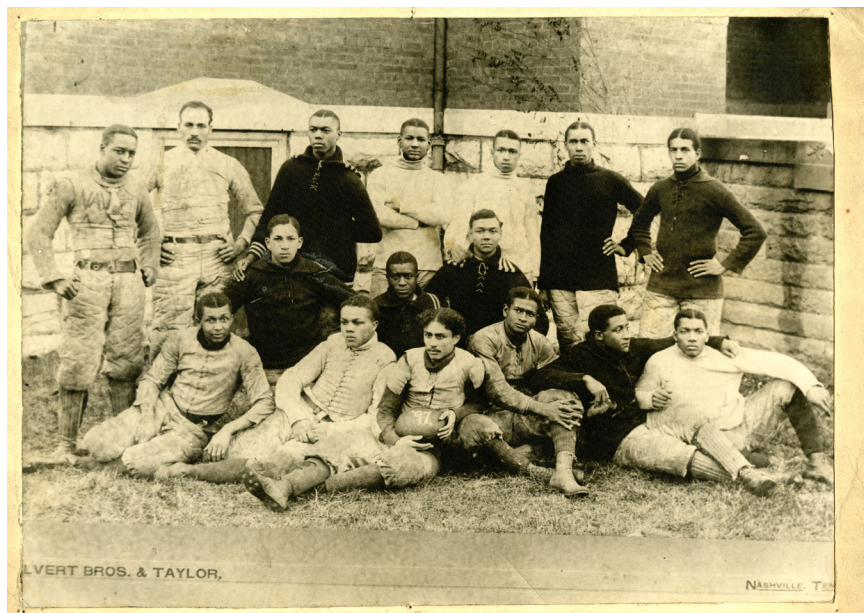
Fisk University Bulldogs Football Team, 1897. Silver gelatin developing-out print.