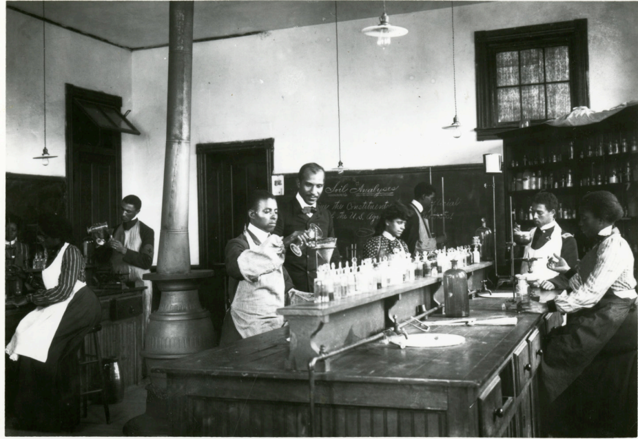
George Washington Carver oversees a student conducting soil analysis, Tuskegee Institute (University), 1902. Silver gelatin developing-out print.

It happened to us. I can attest that [a PWI] bought the [name] collection, and it was housed at [an HBCU] at the time.... Back then, I think they put it on CD ROMs or whatever, and they started selling it and making money from it and that sort of thing. — Doctoral, Large, Public