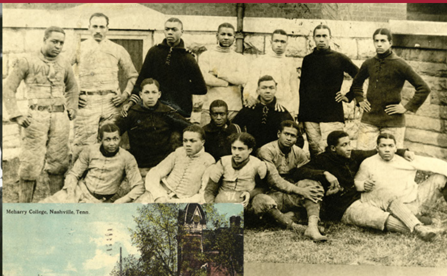
Meharry College, Nashville, Tenn.