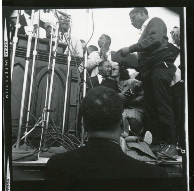
Dr. Martin Luther King, Jr. and Coretta Scott King, date unknown. Silver gelatin developing-out print.

really looking to get their hands on it to see what he actually did and all of his contributions, not only to the college, for the state, but just around in general. — Associate's, Medium, Public