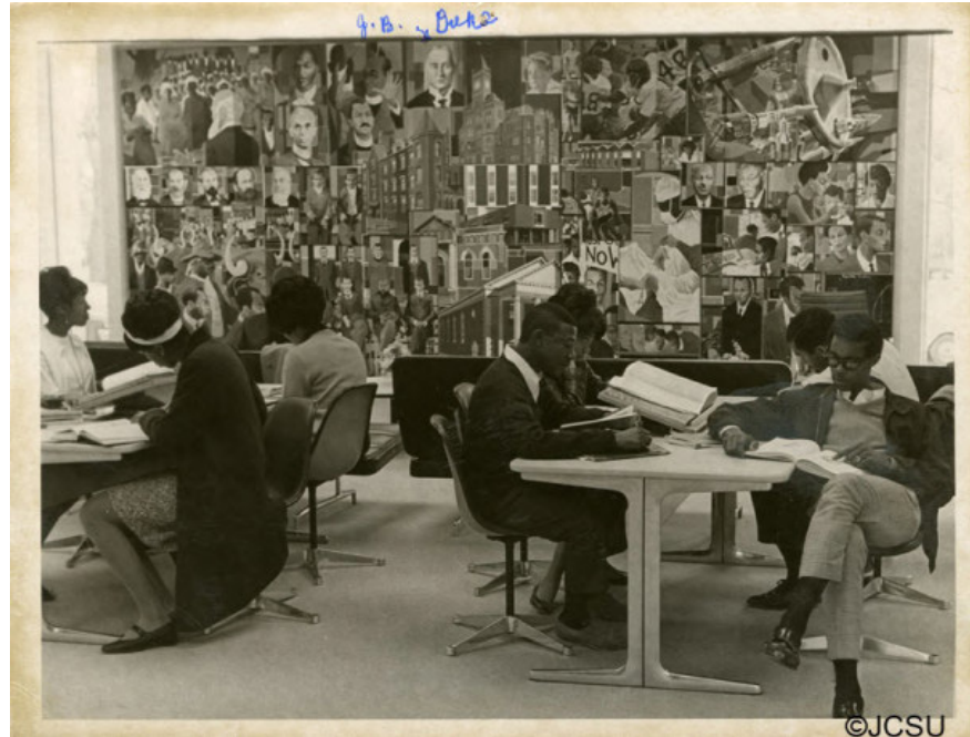
Early photograph of the library. Silver gelatin developing-out print.

And so, about the African and African American studies program, everybody's excited about that. But what about the collection that's going to support those things? Can you get excited about that? Can you get excited about the funding that is necessary? It's very tiresome to continue to be advocates of these collections, because we know how valuable and enriching it is to not only our university, but to the kind of community that we'll often refer to.... But it's not important enough for you to support it. It's not important enough to you to see that we need manpower to process these collections so [they] can be even bigger and better. That fight has been a fight since I've been at (this institution). [For] all my colleagues, that has been the fight. And at some point, that conversation has to change.... If we're going to contribute to helping people understand who we are as HBCUs, who we can serve in our community [and] who we've been serving in higher education, then we have to support our archives. We have to support our library. That's where the records are, and they are at risk every day. — Master's, Small, Private