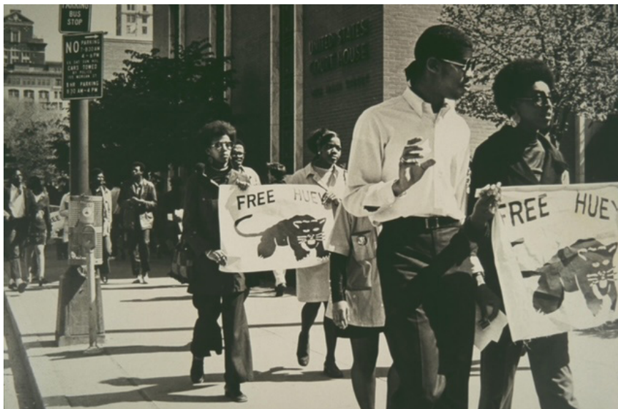
Marching in support of “Free Huey” movement to release Black Panther Huey Newton from prison. Silver gelatin developing-out print.

chat services, as well as doing information literacy classes via Zoom and things like that. — Bachelor’s, Very Small, Private