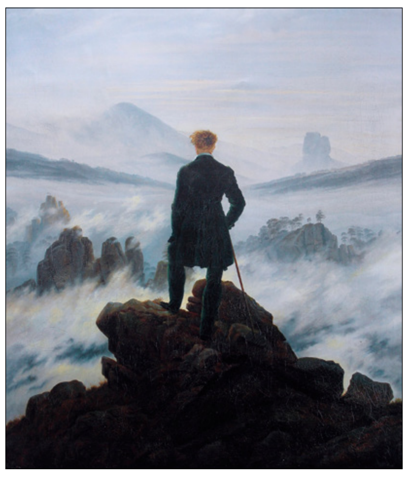
Fig. 3: Der Wanderer über dem Nebelmeer (Wanderer above the Sea of Fog) 1818, Caspar David Friedrich

Although appreciation for talent should never be discouraged, such attitudes belie the moments of breakthrough and innovation that are deeply rooted in previous research, the contemporary academic climate, and the contributions and collaborations of many